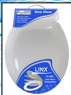
Hang Sell Packaging